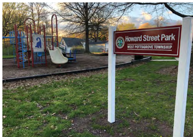
Howard Street Park