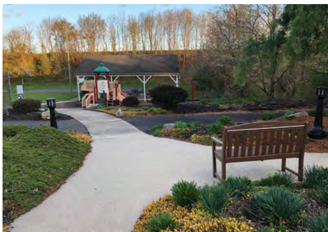
Township Park & Pavilion

The Township is always open to hearing ideas from our residents for new park or recreation projects, or improvements they would like to see made at our existing park and open space recreation areas. Please do not hesitate to contact us at the contact information listed above.