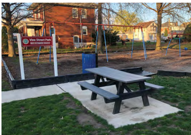
Vine Street Park