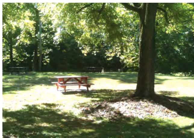
Ralph F. Murgia Park